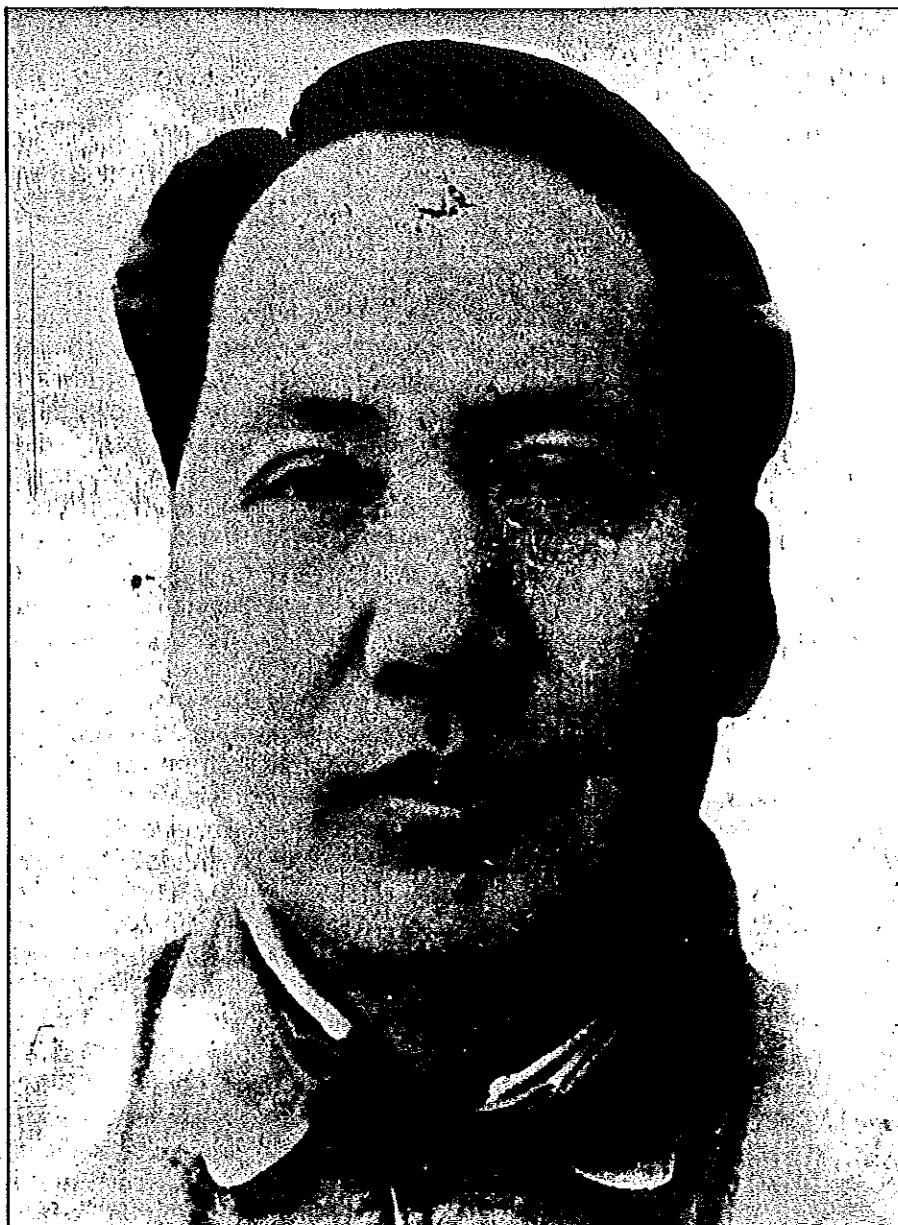
Mao Zedong after the Second World War and before his final victory over the Nationalists.

conduct' campaigns, which, in effect, were a set of purges by which he removed party opponents. It was also during this time that Mao led the CCP from its northern bases in a spirited resistance to the Japanese occupation. Mao's main strategy was to win over the peasants who made up 80 per cent of the Chinese population. His success in this had the double effect of providing military recruits for the anti-Japanese struggle and political supporters for the CCP in its campaign against the urban-based GMD.