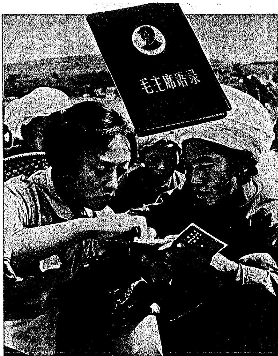
A young woman from Shanghai helps a commune member to study Mao's works. The Thoughts of Chairman Mao, enshrined in his 'little red book', constituted a sacred text.

collectivisation programme which ended private ownership. The dislocation this caused produced a national catastrophe. Between 1958 and 1962, 30 million Chinese died from starvation.